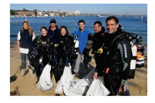
Capacity of Volunteer Groups Where are these groups and what makes them tick?